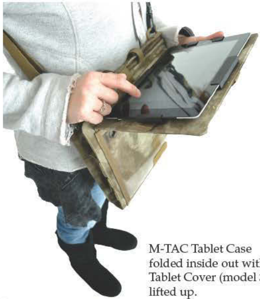
M-TAC Tablet Case folded inside out with Tablet Cover (model 3) lifted up.