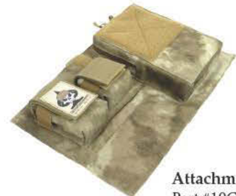
Attachment 1 Part #10C5300