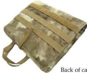
Back of case