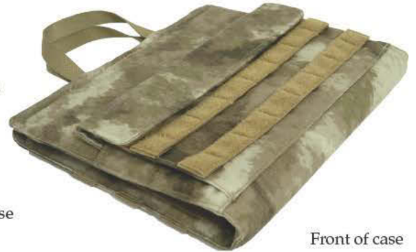
Front of case