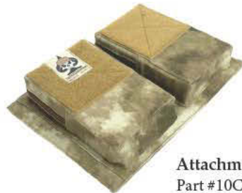
Attachment 2 Part #10C5301