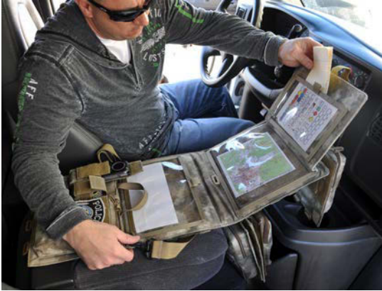
Flip over the tablet cover in tri-fold view as shown for even more accessibility to documents. With so many configurations, positions, and attachments, the M-TAC Pack can easily become a center console in your car if you wanted it to.