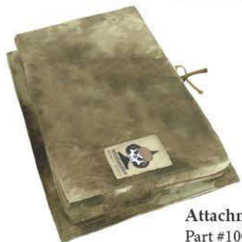
Attachment 3 Part #10C5302