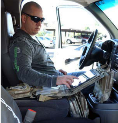
Open up the M-TAC Case like so for easy tablet use.