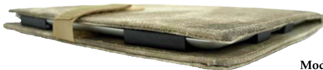
Model 3 Part #10C5102