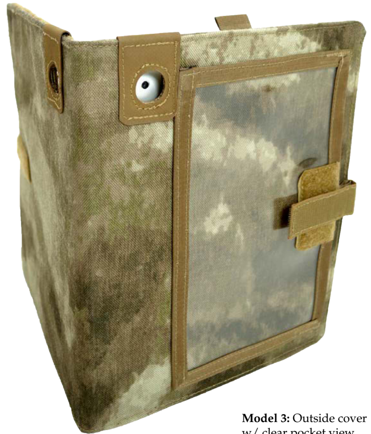
Model 3: Outside cover w/ clear pocket view