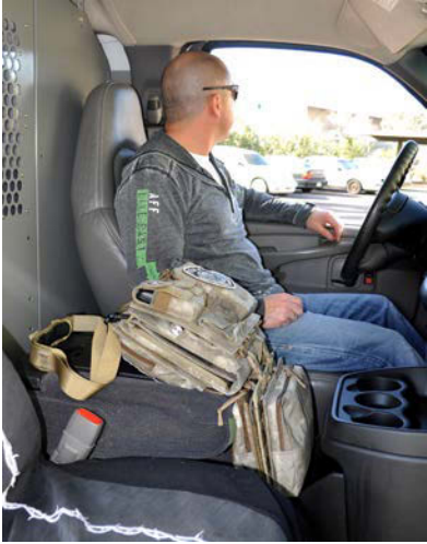
M-TAC Pack is shown with lower dual-saddle extension attached. (saddle extension sold separately)