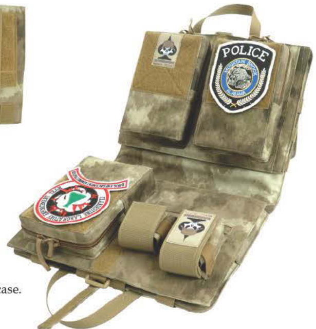
Attachment 1 & 2 with case.