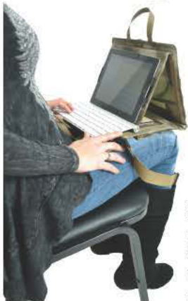
Showing M-TAC Tablet Case with Tablet Cover folded in triangle position for easy viewing while typing on wireless Apple keyboard.