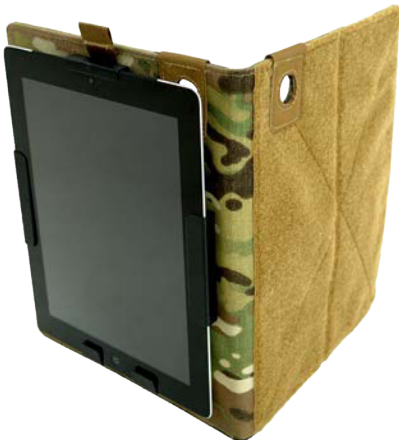
Model 3: Inside cover w/ iPad 2