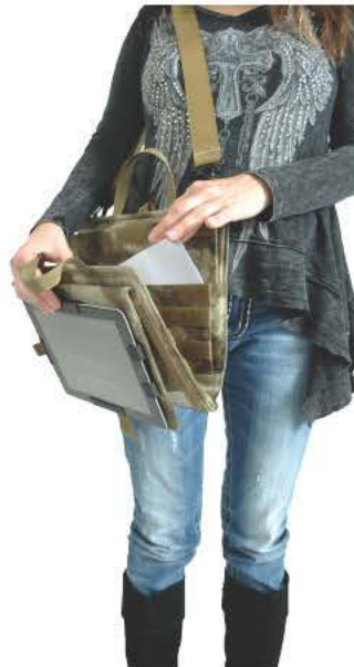
Showing the quick and easy access that the front pocket gives you when on the go.