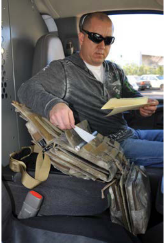
Just flip over the saddle attachment and reach into the front pocket of M-TAC Case for more accessibility to documents.