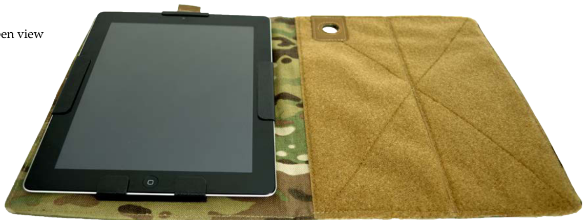
Model 3: Inside cover in open view