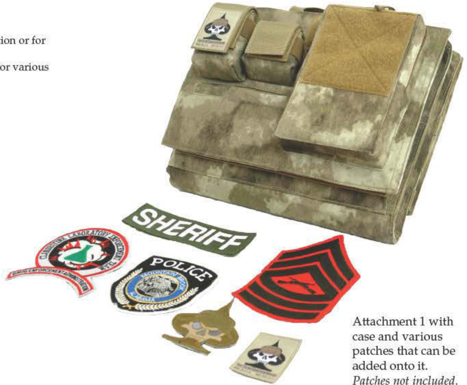
Attachment 1 with case and various patches that can be added onto it. Patches not included.

Velcro with straps on back of all attachments.