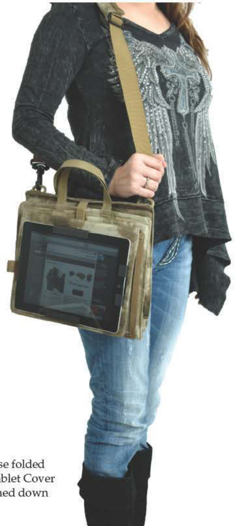
M-TAC Tablet Case folded inside out with Tablet Cover (model 3) positioned down against case.